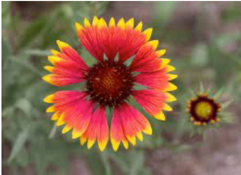
Club Flower: Gaillardia