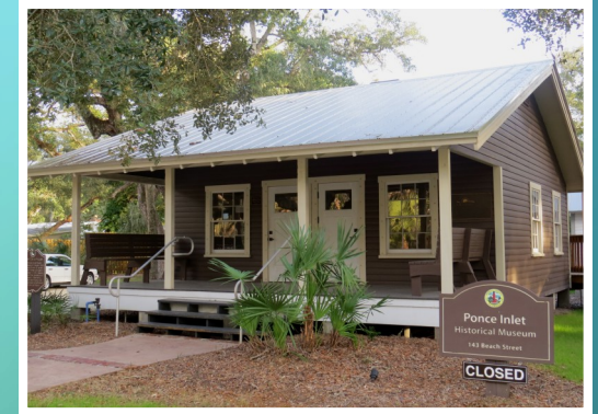
Ponce Inlet Historical Museum