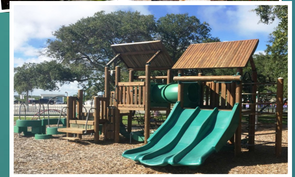
Ponce Inlet Parks