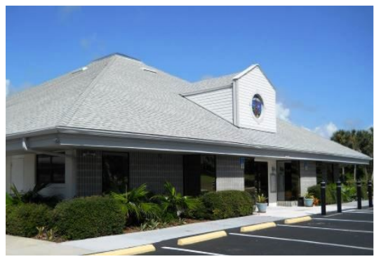
Ponce Inlet Community Center

Over the years, CFPI has been helpful in saving the Town money and has been influential in many important town decisions and positive changes. In 1987 this group helped raise money to build the Ponce Inlet Community Center.