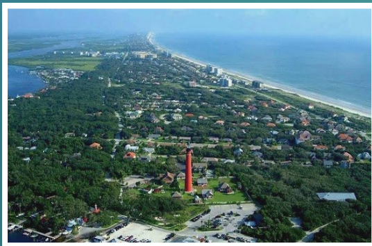
Ponce Inlet - Bird's-Eye View

Ponce Inlet is a small town at the southern-most point of a barrier island. Home of the tallest Lighthouse in Florida, it was originally named Pons Park in the middle 1880's by Brigadier General Orville Babcock the engineer appointed to build the Lighthouse. The town was incorporated on August 20, 1963.