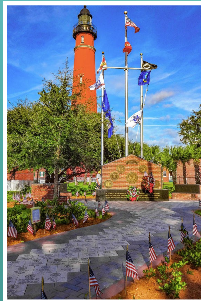
Veteran's Memorial & Lighthouse

Citizens For Ponce Inlet, Inc. Ponce Inlet Community Center 4670 S. Peninsula Drive Ponce Inlet, Florida 32127